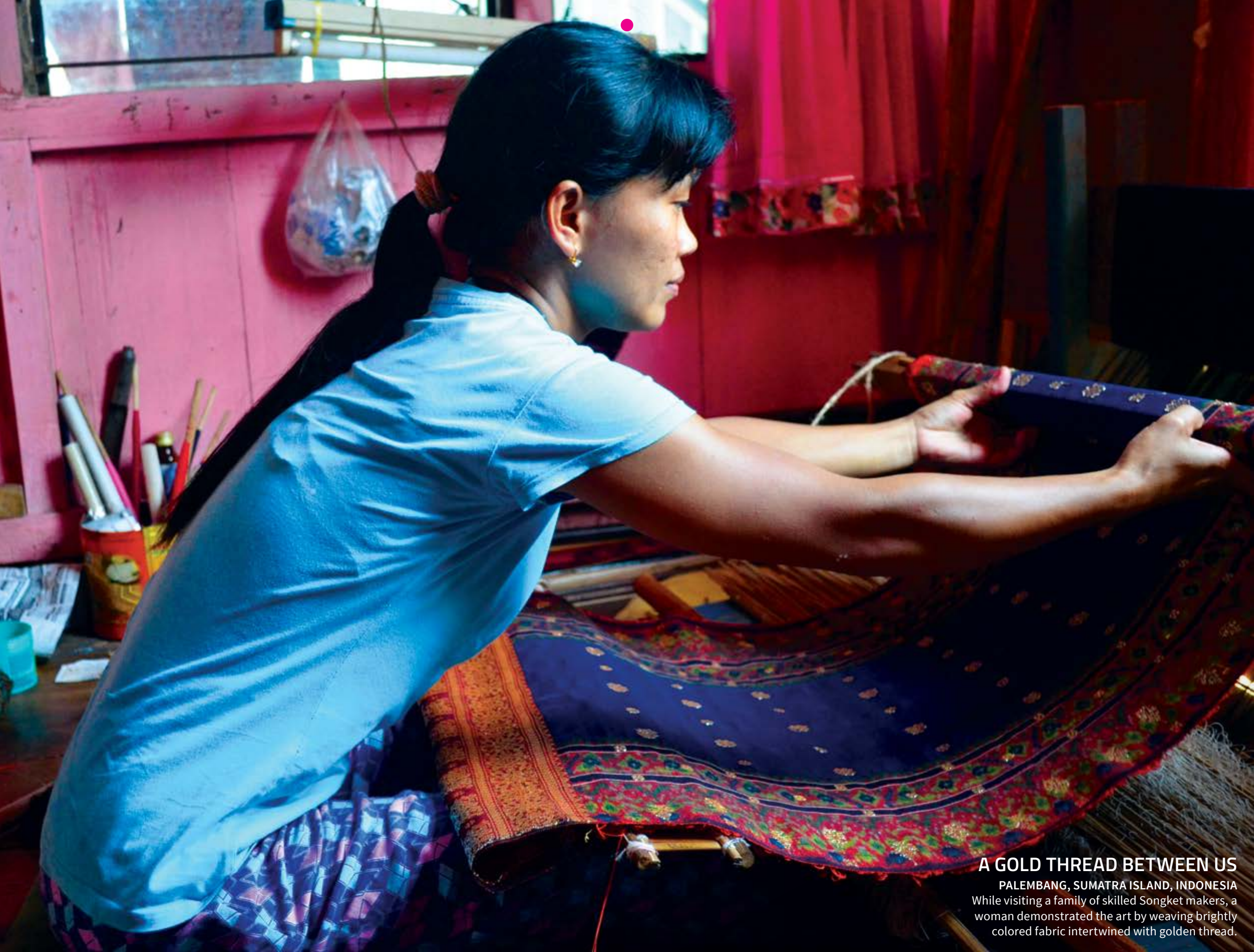
A GOLD THREAD BETWEEN US PALEMBANG, SUMATRA ISLAND, INDONESIA While visiting a family of skilled Songket makers, a woman demonstrated the art by weaving brightly colored fabric intertwined with golden thread.